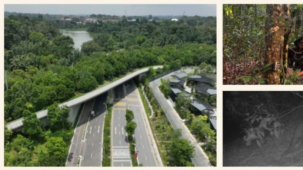
Camera traps on the Mandai Wildlife Bridge help monitor wildlife movement, including Sunda Pangolins.

The Mandai Rejuvenation Project represents a significant effort to transform the Mandai precinct into a unique 'window into the wild', inspiring our guests through the fascinating world of wildlife. The project will integrate five wildlife parks with nature-themed experiences, green public spaces and an eco-friendly resort. In our commitment to being a responsible steward of the Mandai Wildlife Reserve, careful planning from the concept stage of the project ensured the successful execution of mitigation measures to minimise the impact on the nature around us.