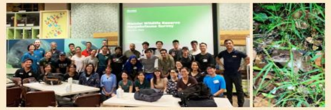
Mandai Nature led a team supported by staff from Mandai Wildlife Group and members from the Herpetological Society Singapore to conduct a herpetolauna survey across Mandai Wildlife Reserve's four parks. A total of 29 species were spotted, including the Red-tailed Racer, Malaysian Giant Frog (above right) and Copper-cheeked Frog.

One of the initiatives include joint biodiversity surveys between Mandai Nature and Mandai Wildlife Group to better understand and determine the status of wildlife present in the Group's wildlife parks and its surroundings. This data also helps inform researchers on conservation and management actions such as rescue and rehabilitation, ex situ protection, as well as further research and monitoring.