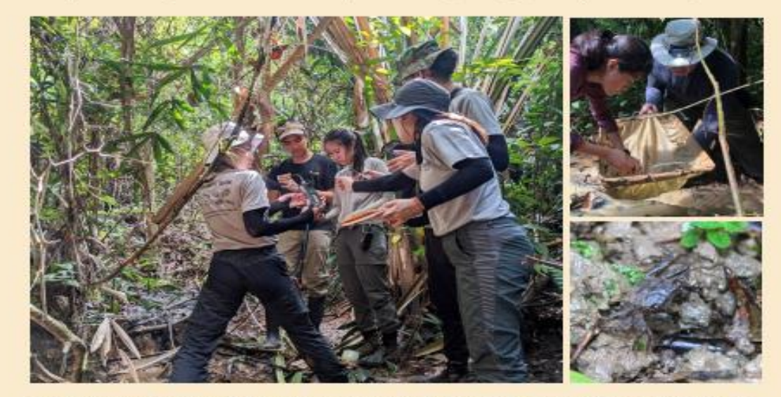
Mandai Nature joined a team led by the Freshwater and Invasion Biology Lab and Lee Kong Chian Natural History Museum, National University of Singapore, to assess aquatic fauna within a freshwater stream at Night Safari. Species found included two crustaceans of local conservation significance, including the Johnson's Freshwater Crab (above).