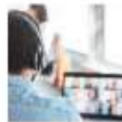
Accessible & Inclusive Travel Course