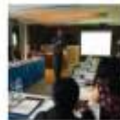
Private or Custom Training