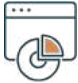
Management Structure & Framework

The Wayfinder unifies destination organizations in their understanding of stewardship and how to approach it. Made up of nine core modules, the Wayfinder framework is a set of standards recognized by the Global Sustainable Tourism Council and aligned with the United Nations Sustainable Development Goals .