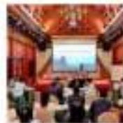
Sustainable Hotel Course