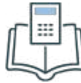
Resiliency, Risk & Crisis Management