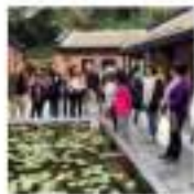
Sustainable Tourism Course