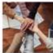
Applied DEI in Travel Course