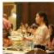
Sustainable Business Travel Course