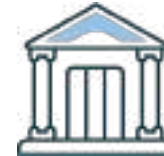
Identification & Preservation of Culture & Heritage