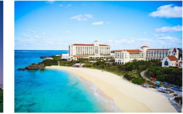
Nikko Hotels International has obtained the "SAKURA QUALITY An ESG Practice" certification, a standard recognized by the GSTC. (Left: Grand Nikko Tokyo Daiba, Right: Hotel Nikko Alivila/Yomitan Resort Okinawa)