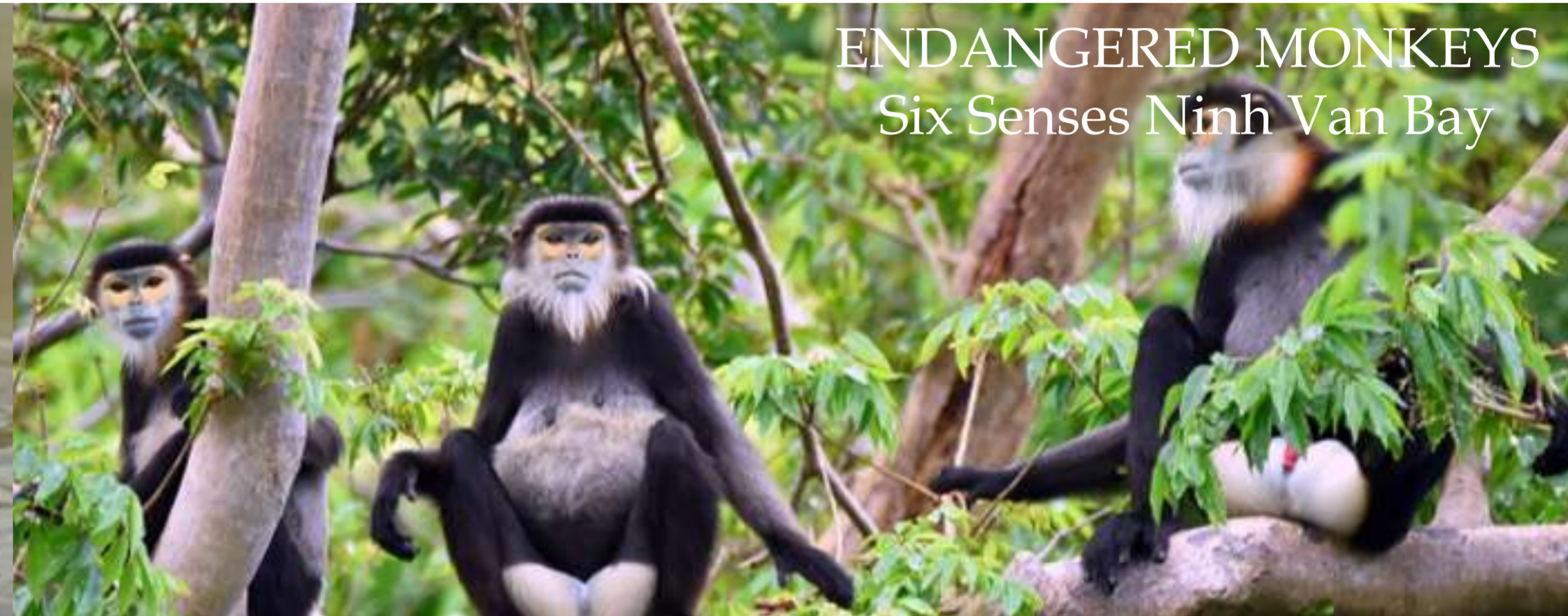
ENDANGERED MONKEYS Six Senses Ninh Van Bay

7,511 turtle hatchlings released safely into the ocean in partnership with Condao National Park