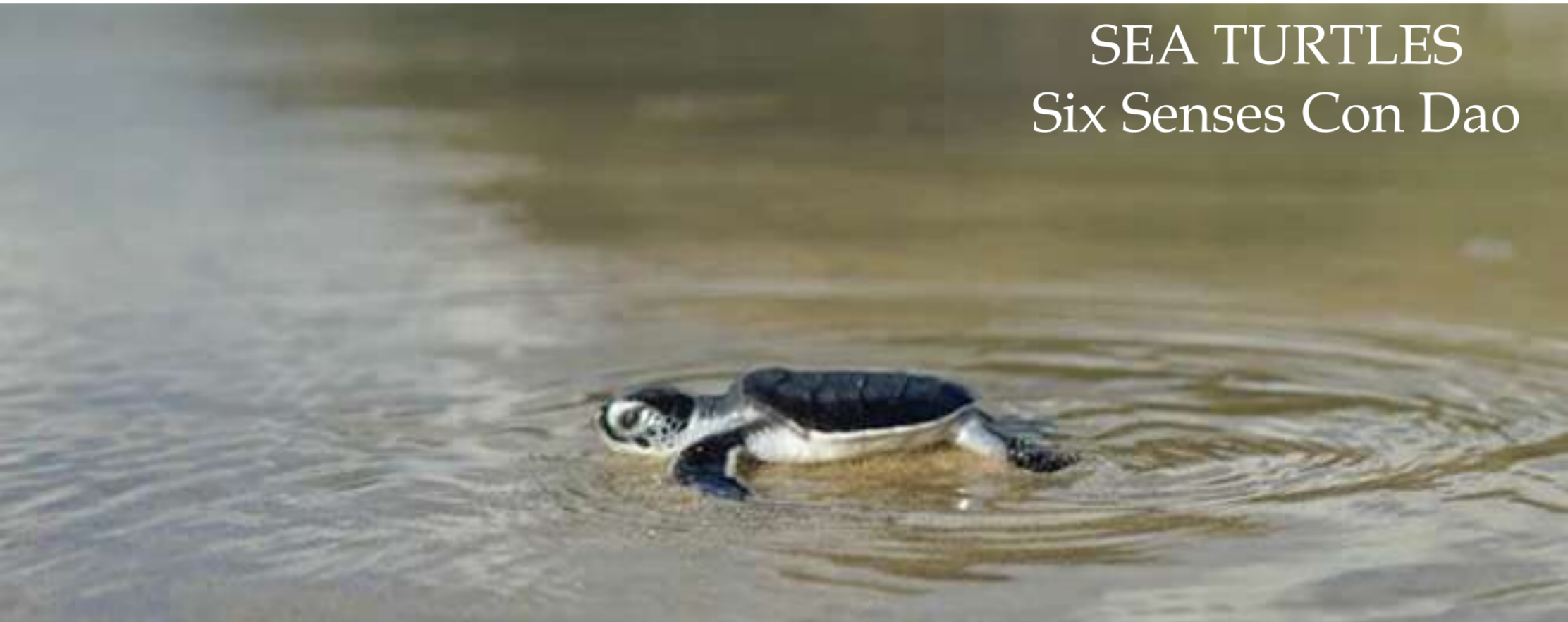
SEA TURTLES Six Senses Con Dao

7,511 turtle hatchlings released safely into the ocean in partnership with Condao National Park