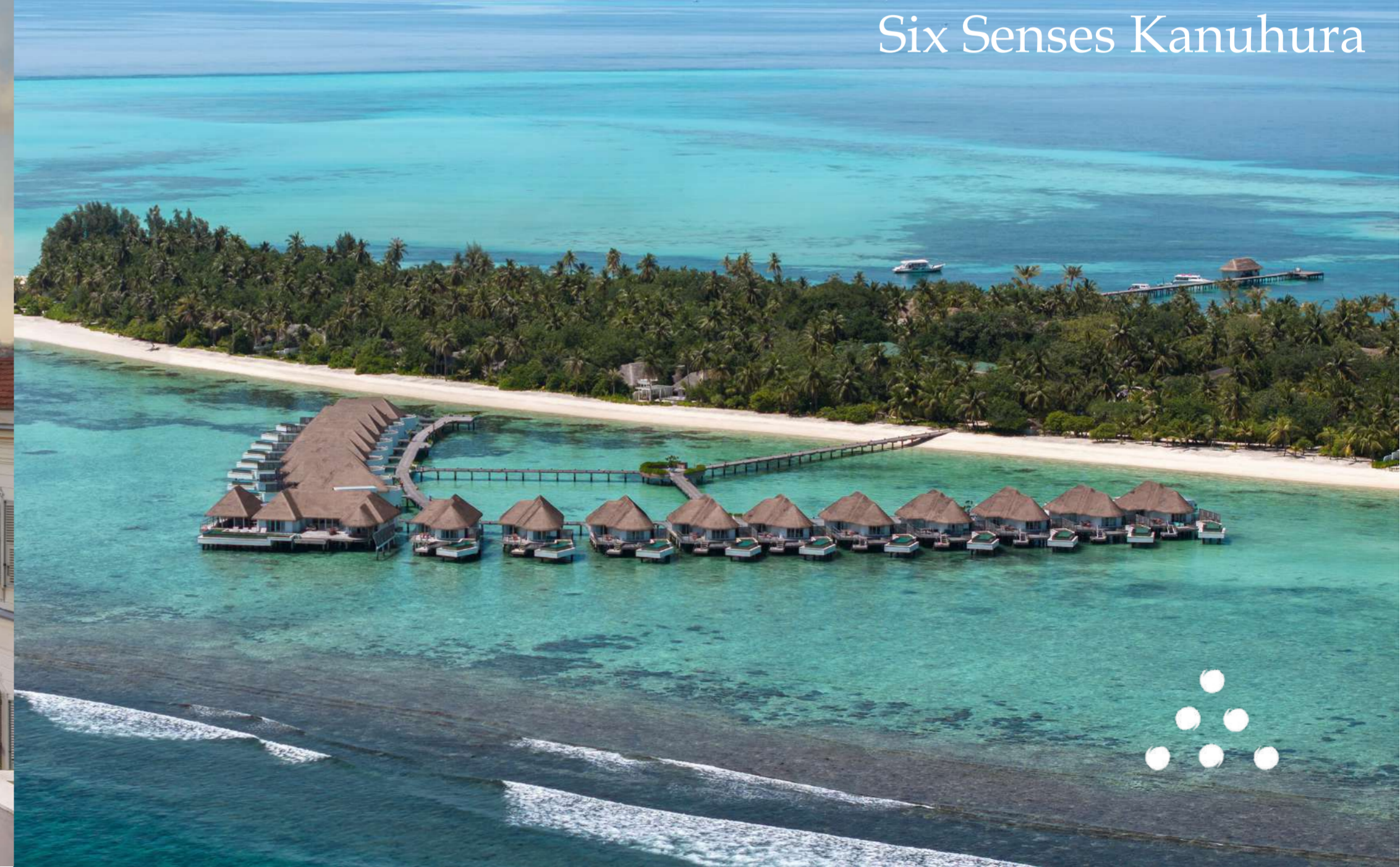
Six Senses Kanuhura