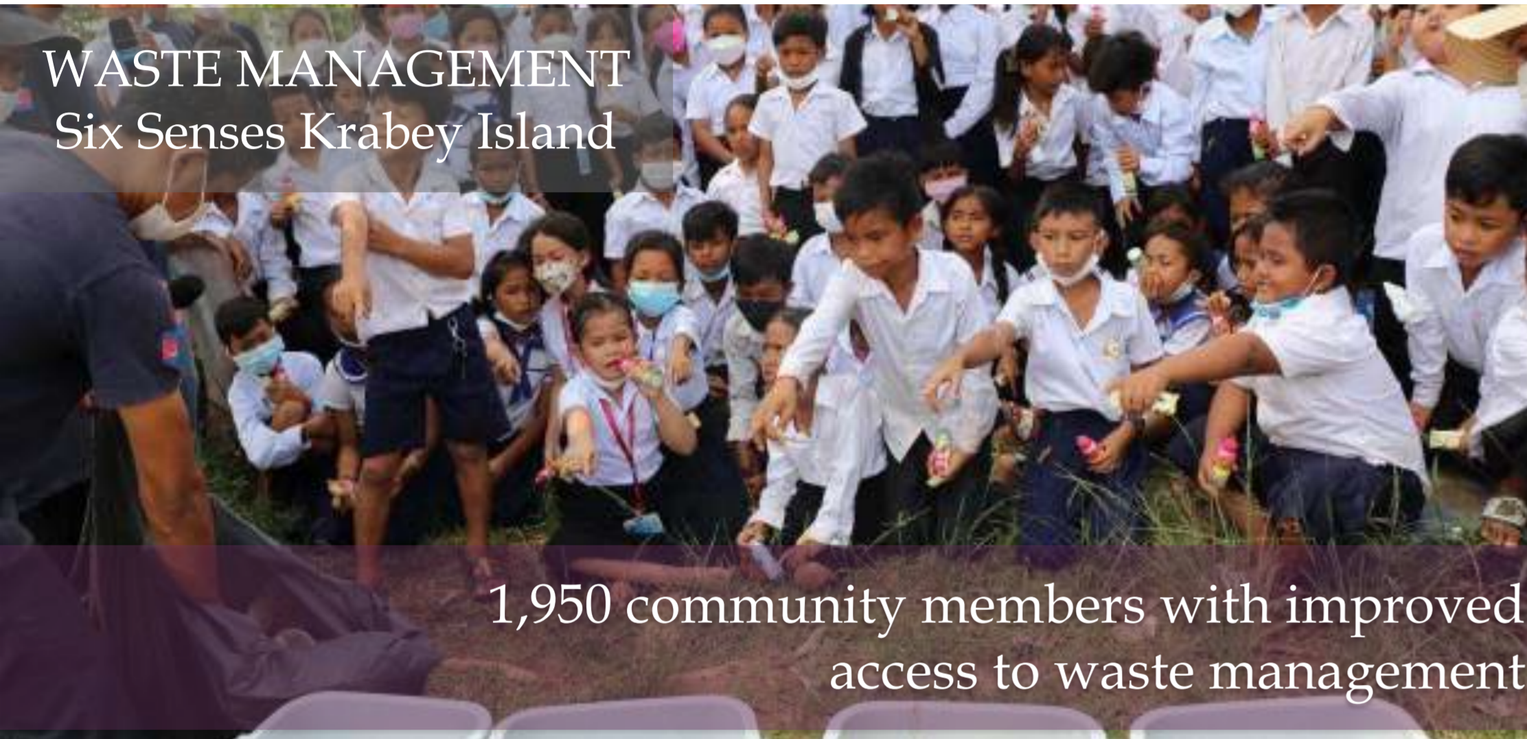
WASTE MANAGEMENT Six Senses Krabey Island

1,950 community members with improved access to waste management