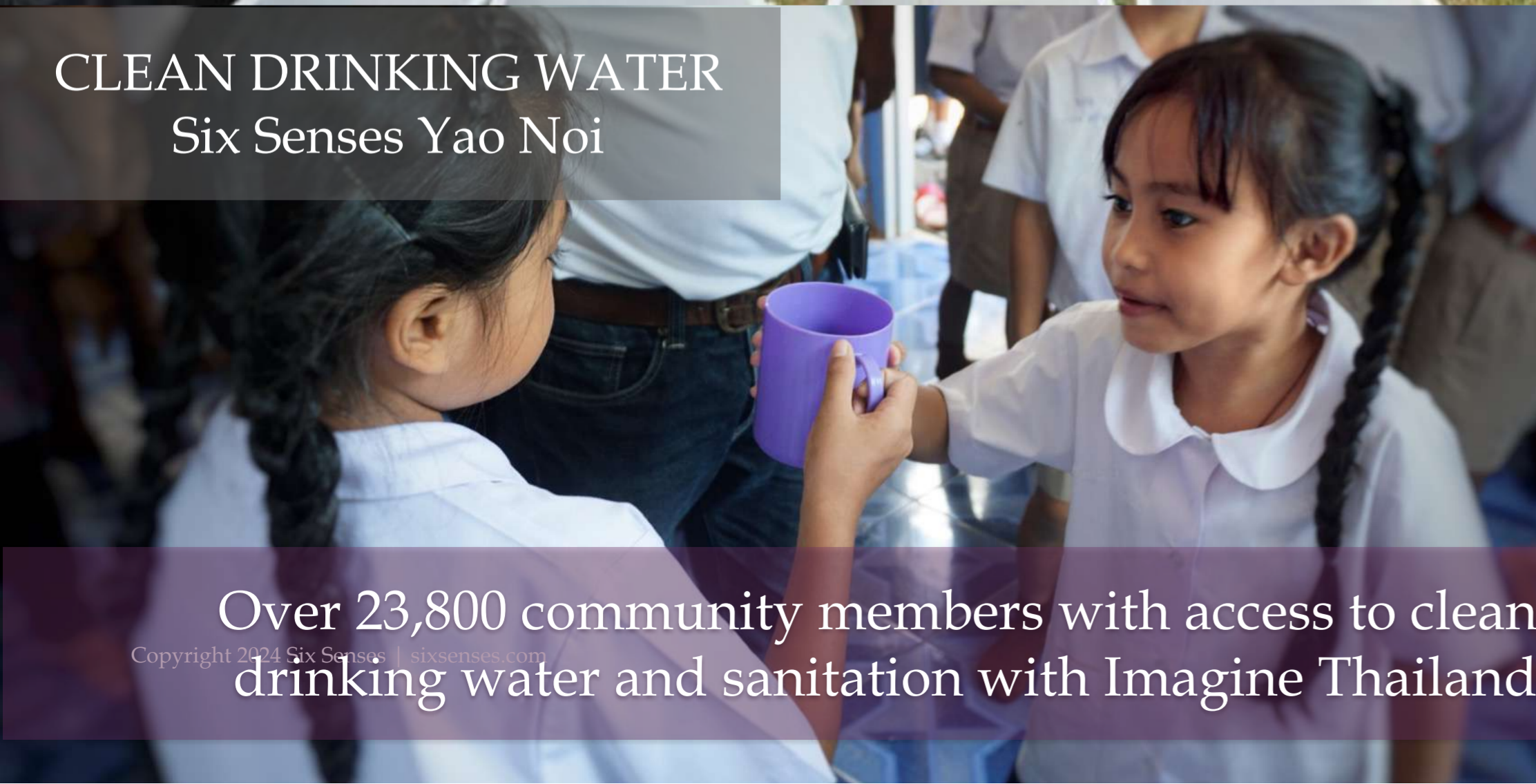
CLEAN DRINKING WATER Six Senses Yao Noi

374 school kids learned about water as a scarce resource across 398 hours of teaching