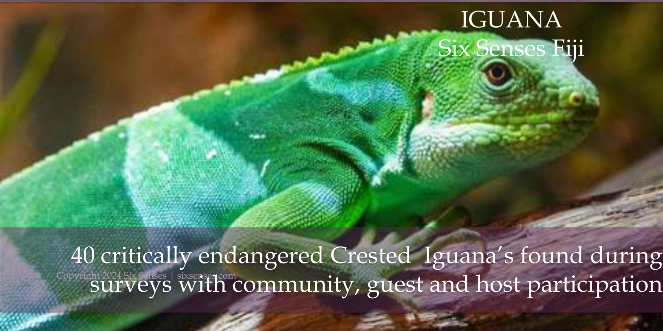
IGUANA Six Senses Fiji

170 Black-shanked Douc Langur monkeys monitored and protected in collaboration with GreenViet NGO