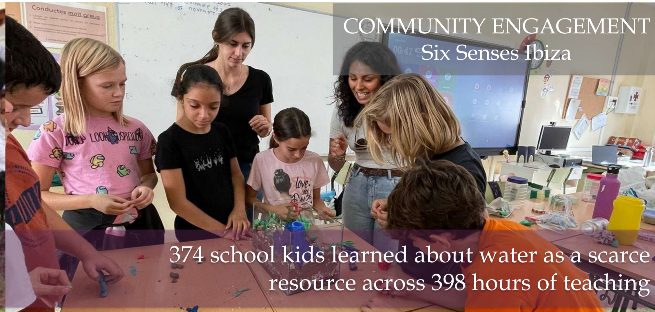
COMMUNITY ENGAGEMENT Six Senses Ibiza

1,950 community members with improved access to waste management