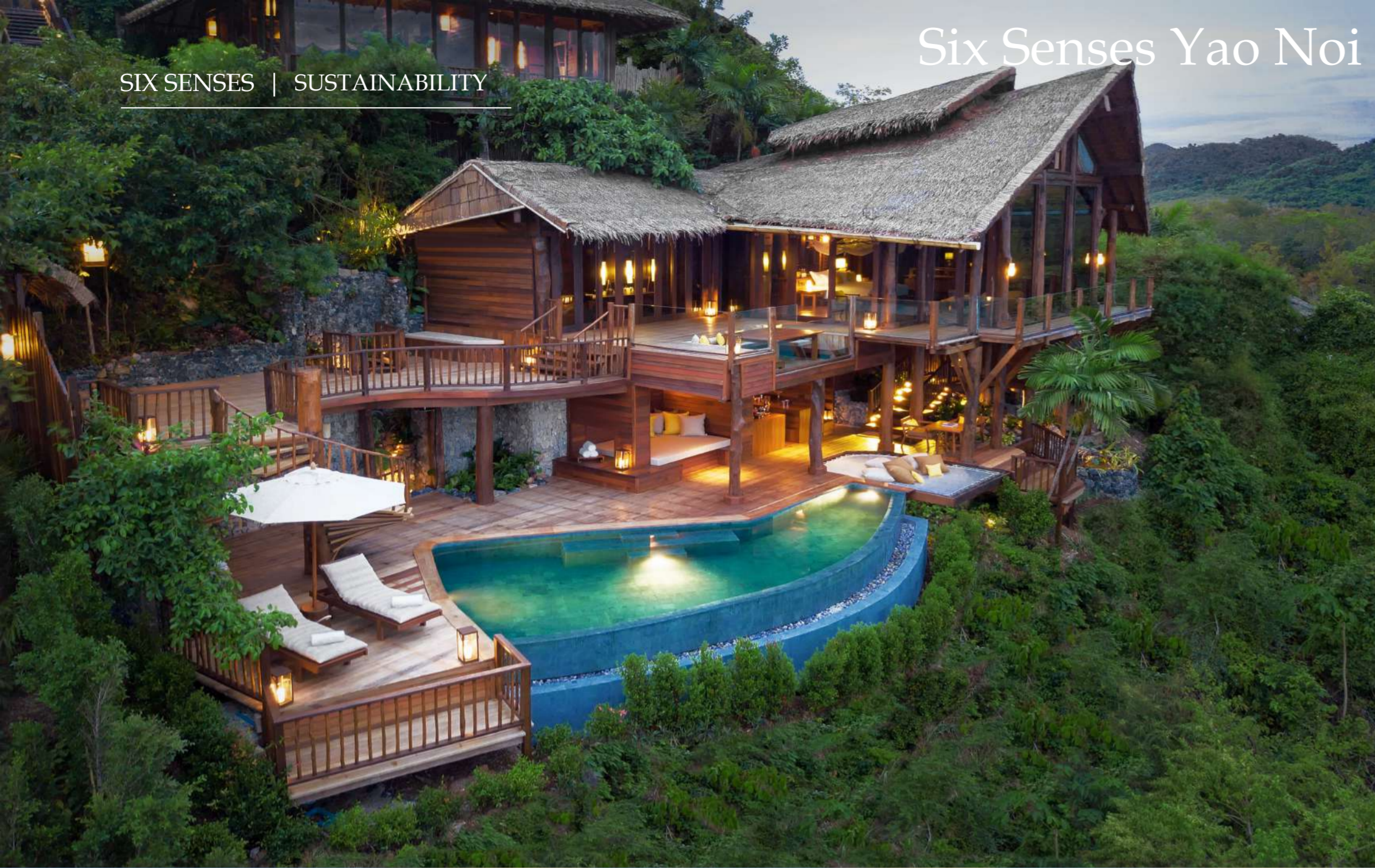
Six Senses Yao Noi