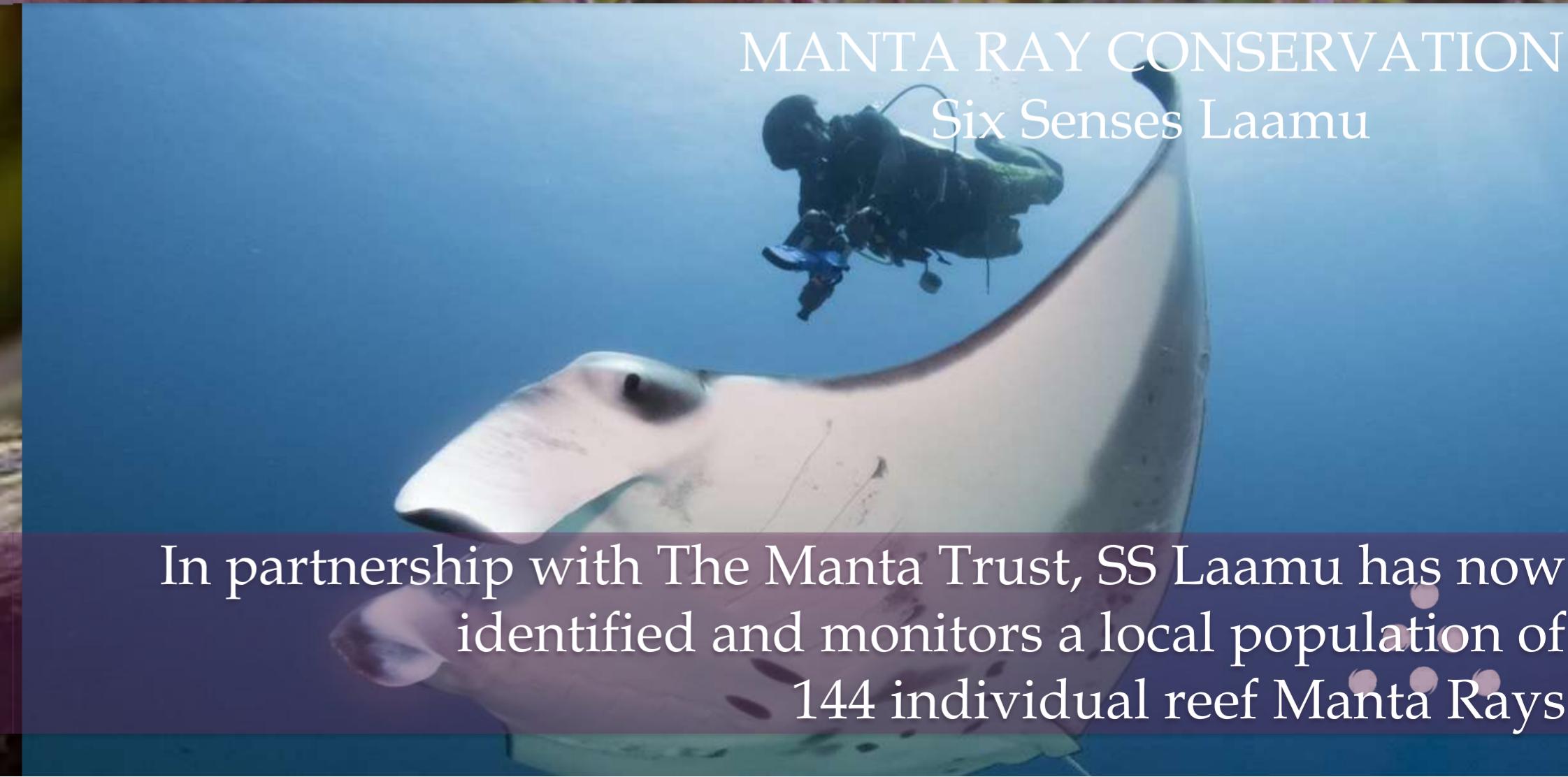
MANTA RAY CONSERVATION Six Senses Laamu

40 critically endangered Crested Iguana's found during surveys with community, guest and host participation