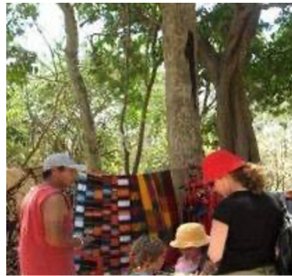
Social & Economic