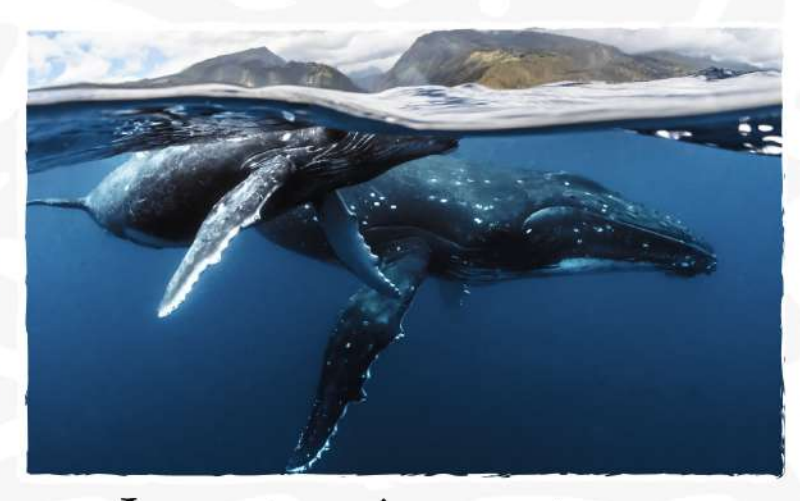
Largest marine sanctuary in the world