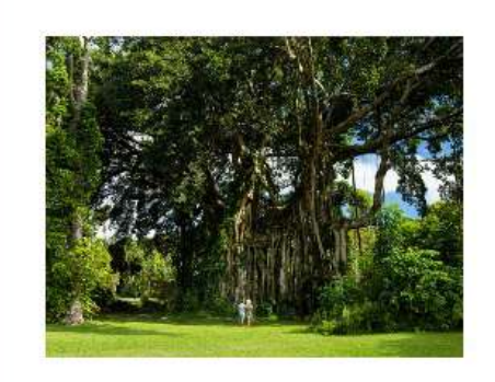
FOCUS 3 Tourism and sustainable ecotourism