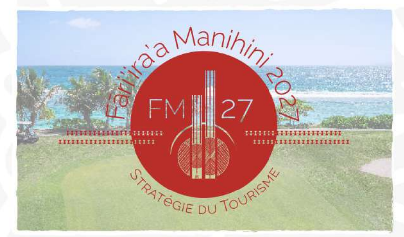
One of the leaders in sustainable tourism