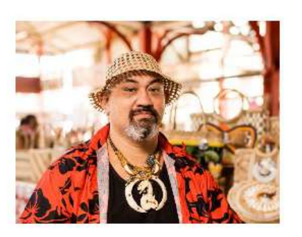
FOCUS 4 Structure and professionalize the different sectors