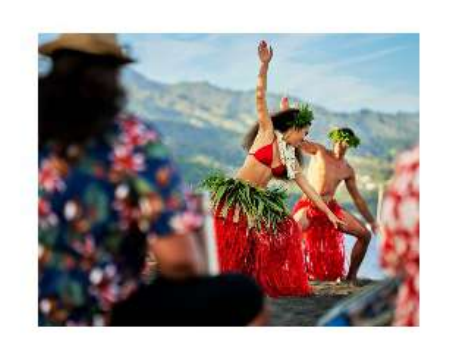
FOCUS 1 Publicize and promote the destination