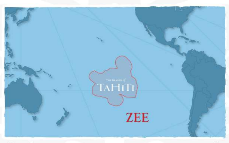
Exclusive economic zone reserved for polynesian fishing fleet