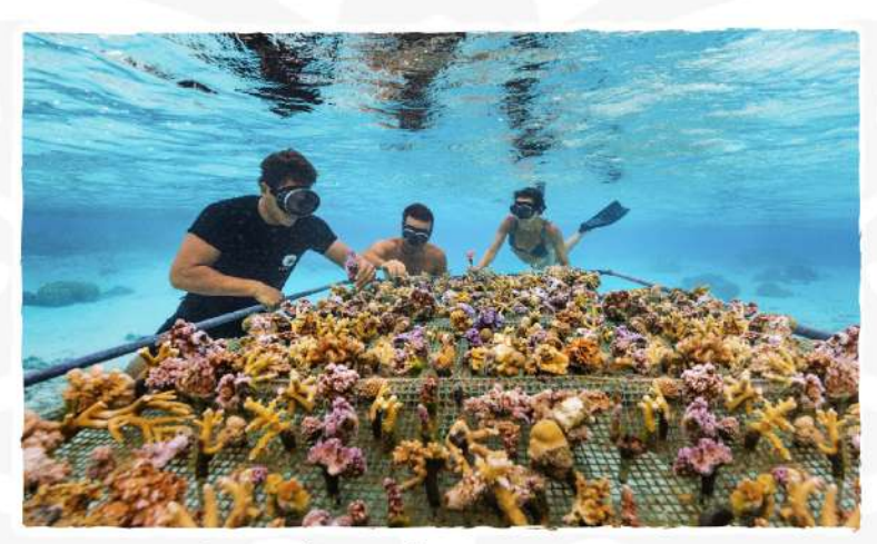
Coral reef restoration