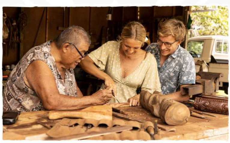
Community and cultural engagement