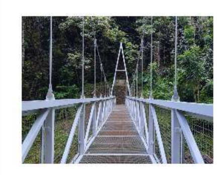
FOCUS 5 Develop infrastructure