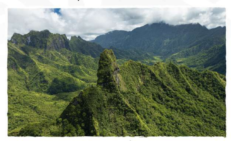
Primary forest protection association