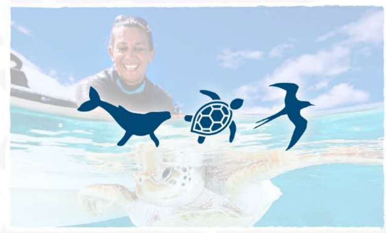
Wild life protection