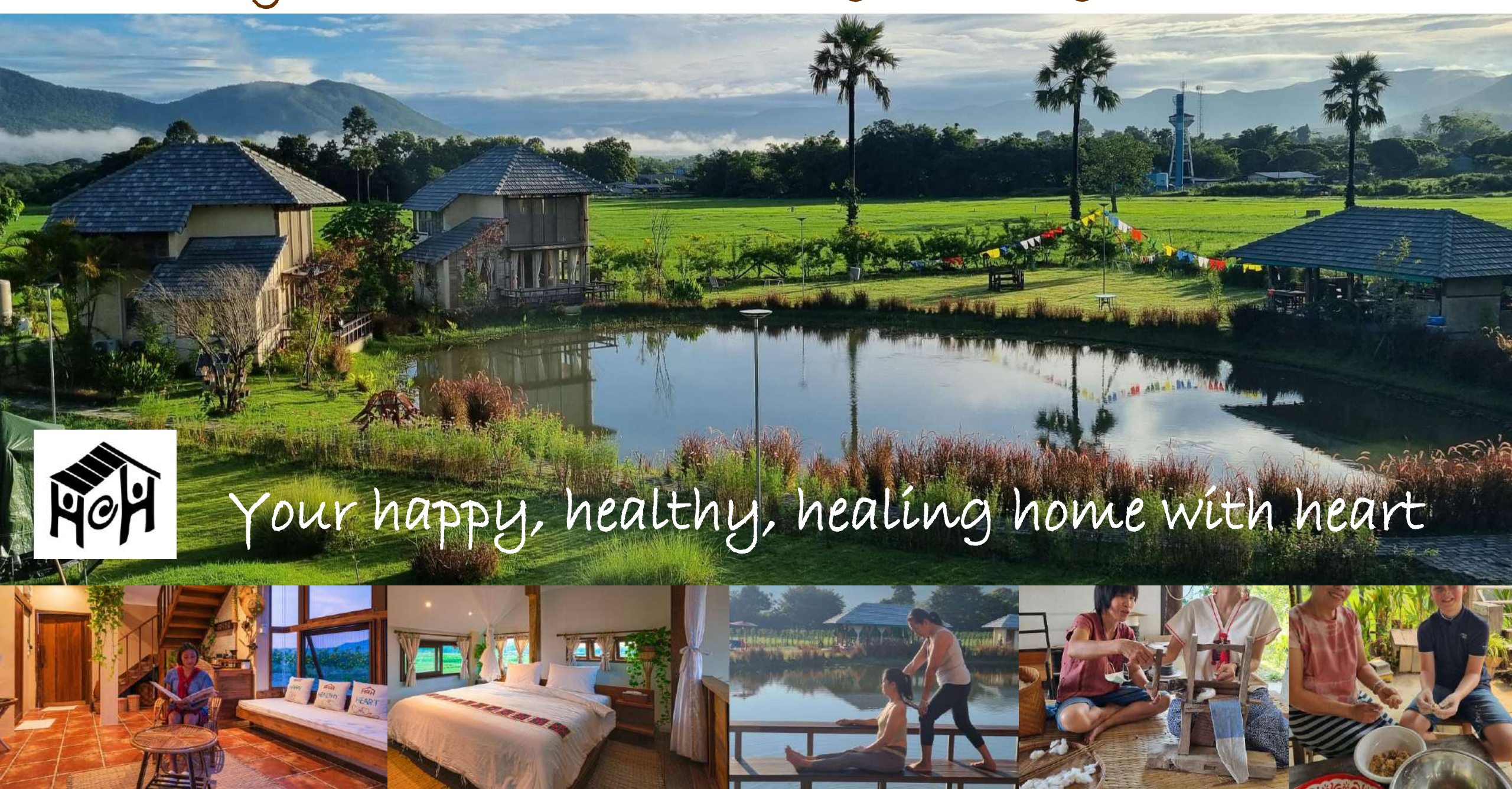
Harmony@Huailan Home Ecolodge, Chiang Mai, Thailand