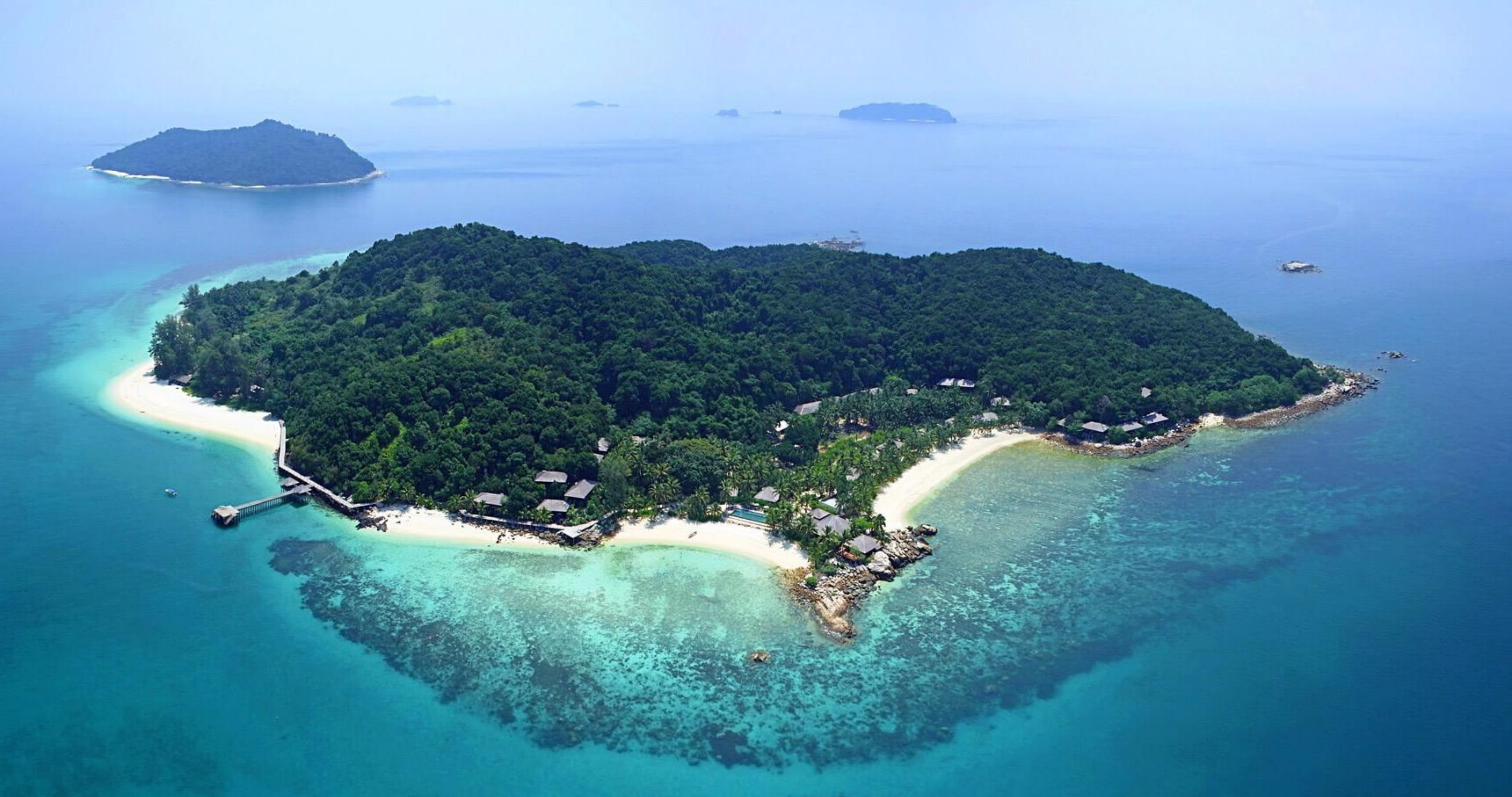
Pulau Tengah, Seribu Archipelago,